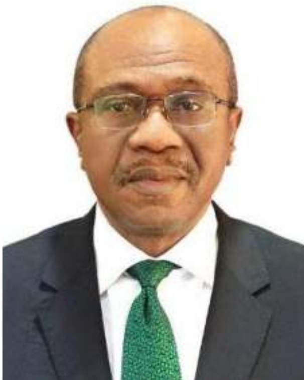
CBN Governor, Mr. Godwin Emefiele

T he Governor, Central Bank of Nigeria (CBN), Mr. Godwin Emefiele has said that the Bank's intervention beyond its traditional mandate of ensuring price and financial system stability as well as securing external reserves, was in realisation of the importance of access to finance and infrastructure for the economy's growth and development.