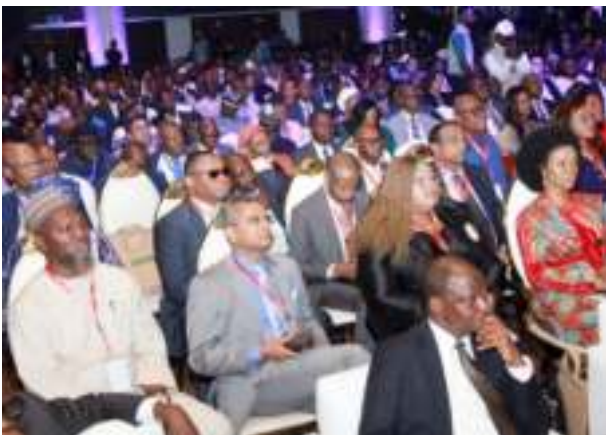
Cross Section of participants at the second edition of the bi-annual Non-Oil Export Summit