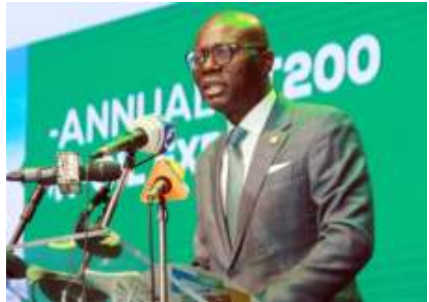
The Lagos State Governor, Mr. Babajide Sanwo-Olu speaking at the event