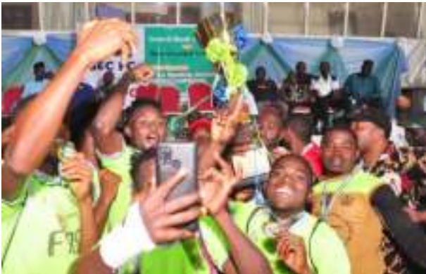
Winners of the 35th 2022 edition of the All-Financial Institutions Football Competition (AFIFC) celebrating their victory

T he Federal Inland Revenue Services (FIRS) Football Club has emerged winners of the 35th 2022 edition of the All-Financial Institutions Football Competition (AFIFC), played on Saturday, December 10, 2022, by edging the defending champions, Securities and Exchange Commission (SEC) Football Club by lone goal.