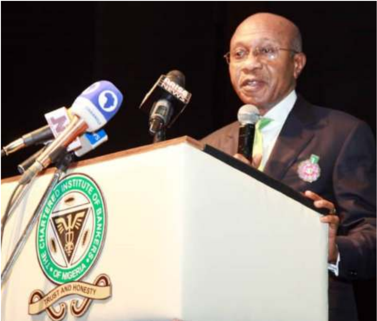
The Governor, Central Bank of Nigeria, Mr. Godwin Emefiele addressing the guests at the 57th Annual Bankers' Dinner in Lagos

T he Governor, Central Bank of Nigeria (CBN), Mr. Godwin Emefiele, has reeled out the Bank's policy focus for 2023, promising that the CBN, guided by best judgment and data will continue to act in good faith to ensure the increased prosperity of the Nigerian economy.