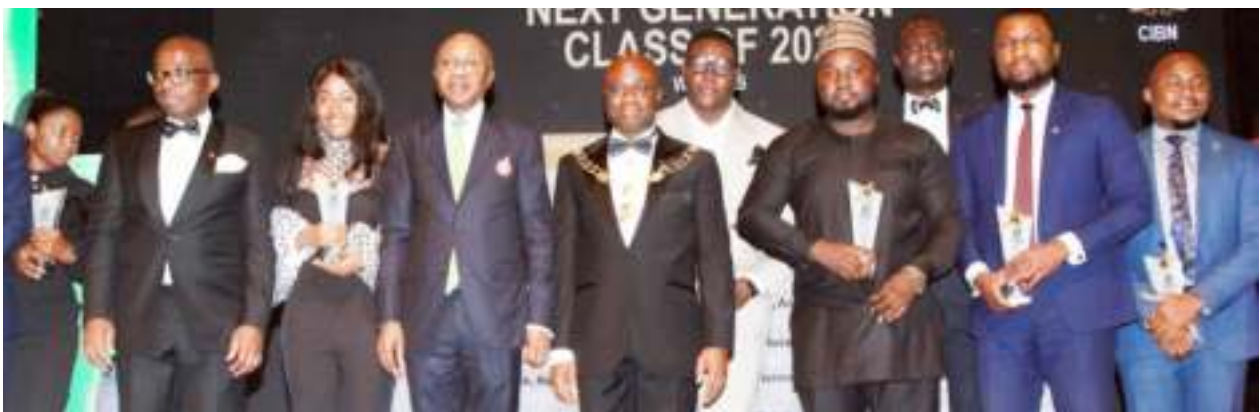
CIBN Next Generation Class of 2023 Award Winners with the Governor of Central Bank of Nigeria, Mr. Godwin Emefiele at the 57th Annual Bankers' Dinner in Lagos