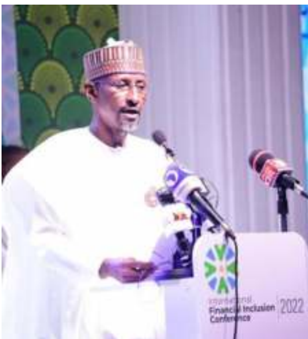
The Minister of the Federal Capital Territory (FCT), Malam Muhammad Musa Bello representing President Muhammadu Buhari

President Muhammadu Buhari, on Thursday, November 24, 2022, restated his commitment to leave a legacy of sustainable and inclusive growth through financial inclusion. He made this resolution at the opening ceremony of the maiden edition of the International Financial Inclusion Conference (IFIC) in Abuja.