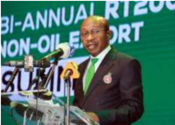
The Governor of the Central Bank of Nigeria (CBN), Mr. Godwin Emefiele delivering a keynote at the second edition of the bi-annual Non-Oil Export Summit