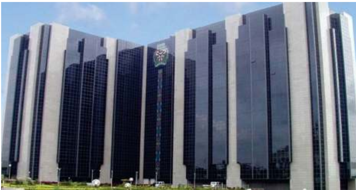
Central Bank of Nigeria, Headquarters

The Central Bank of Nigeria (CBN) has announced plans to engage digital lenders, application developers, start-ups, and financial technology providers to identify flexible and new innovations that would boost financial inclusion.