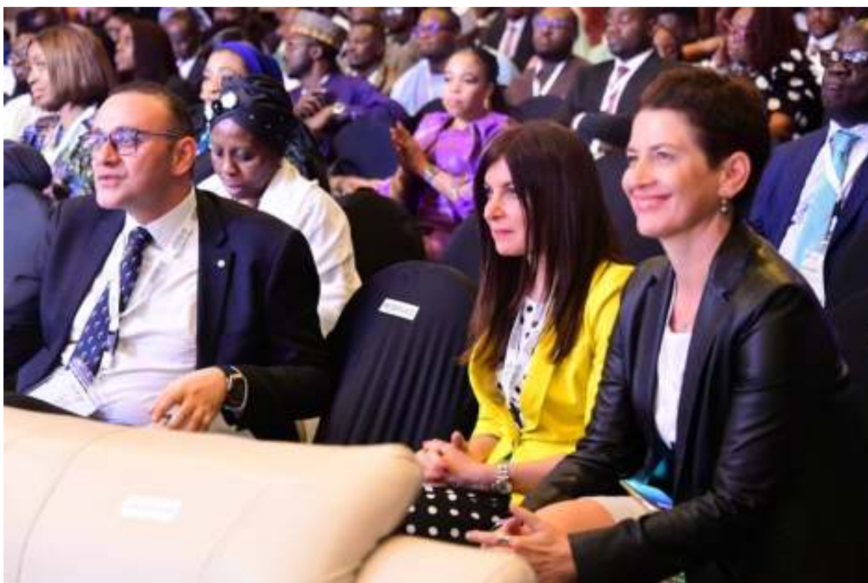
Cross Section of participants at the maiden edition of the International Financial Inclusion Conference (IFIC) in Abuja.

tagged, Economic Recovery & Growth Plan (ERGP); the Anchor Borrowers' Programme (ABP); the micro pension policy, which helped to deepen the penetration of the MSMEs; and the renaming of the Federal Ministry of Communications to the Federal Ministry of Communications and Digital Economy, which enhanced the penetration of broadband internet in the country.