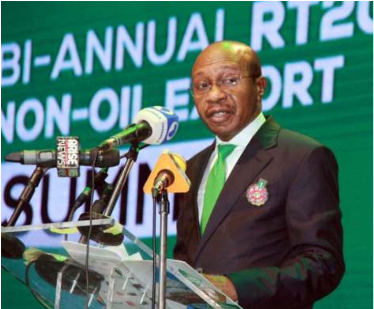
The Governor of the Central Bank of Nigeria (CBN), Mr. Godwin Emefiele delivering a keynote at the second edition of the bi-annual Non-Oil Export Summit

The Governor, Central Bank of Nigeria (CBN), Mr. Godwin Emefiele, says a total of $4.987 billion has been repatriated into the country by non-oil exporters in 2022, under the Race to US$200 billion in Foreign Exchange (FX) Repatriation (RT200) programme launched in February 2022 by the CBN, in collaboration with the Bankers' Committee.