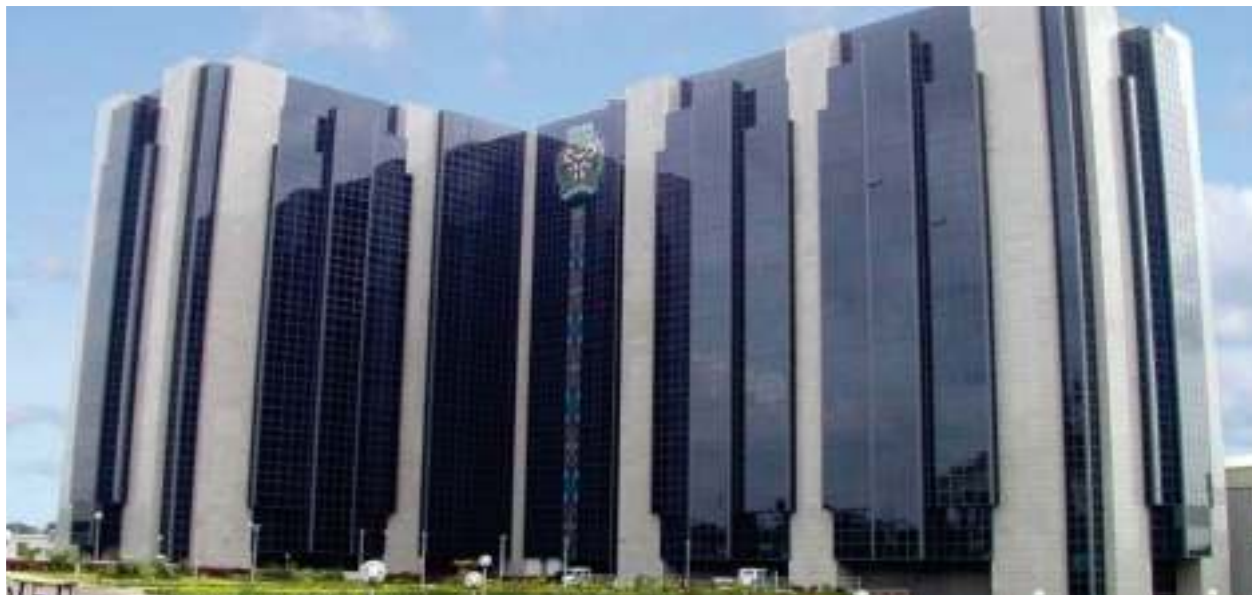
Central Bank of Nigeria, Headquarters

The recent revelation from the Nigeria Bureau of Statistics (NBS) has shown that the non-oil sector, information and technology sectors contributed hugely to the economic performance of the third quarter 2022 Gross Domestic Product (GDP). The NBS further revealed that Non-oil sector contributed 94.34 per cent, while the oil sector did 5.66 per cent. The non-oil sector performance no doubt underscores the increasing importance of the sector.