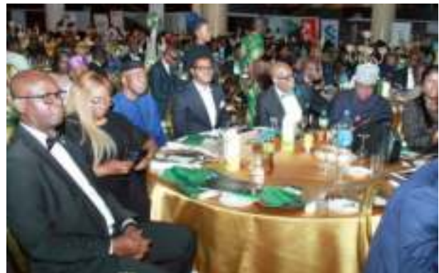
Cross section of guests at the 57th Annual Bankers' Dinner