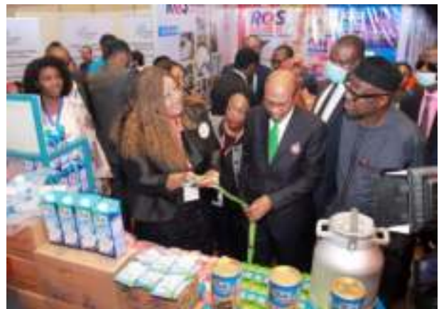
The CBN Governor, Mr. Godwin Emefiele with the Minister of Industry, Trade and Investment, Mr. Niyi Adebayo on a tour of the exhibition stands