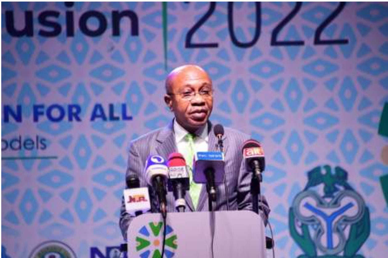
The CBN Governor, Mr. Godwin Emefiele addressing participants at the 2022 International Financial Inclusion Conference, in Abuja

C hairman of the National Financial Inclusion Steering Committee and Governor, Central Bank of Nigeria (CBN), Mr. Godwin Emefiele has reiterated the Bank's commitment to ensure that 95 per cent of Nigerians have access to financial services through the creation of encouraging conditions and providing regulatory support.